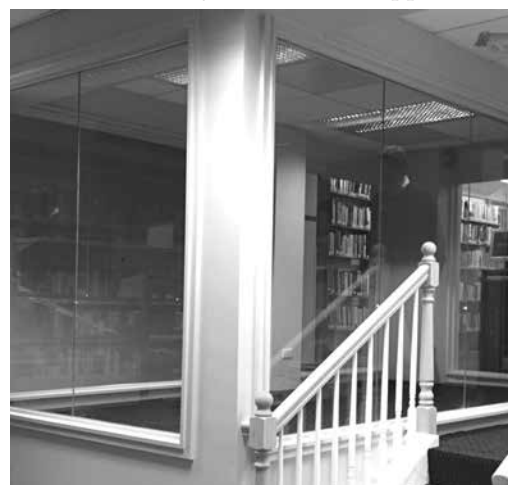
The new lower level meeting room – carpeting and furniture to come.

The library is extremely grateful to the Friends of the Glencoe Public Library, who have pledged $15,000 toward construction costs.